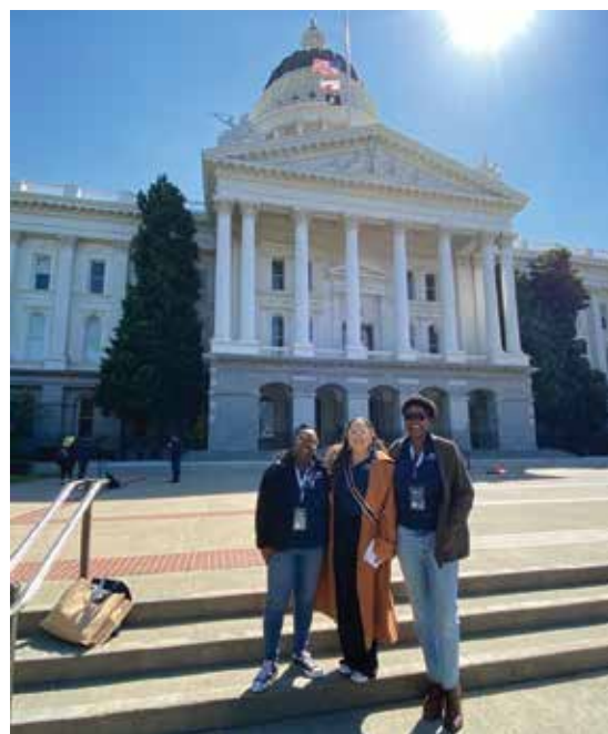
Yuba Sutter Meals on Wheels staff attend Meals on Wheels California Conference, joining others from all over the state to advocate for senior nutrition.

By simplifying a complex application process and providing personalized guidance, the CalFresh outreach team prescreened 1,052 older adults and helped complete 126 applications , making it easier for individuals 60+ to afford nutritious food essential for their health and well-being.