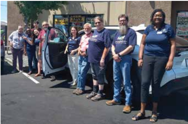
Meals on Wheels volunteers gather with staff for an afternoon of celebration and gratitude